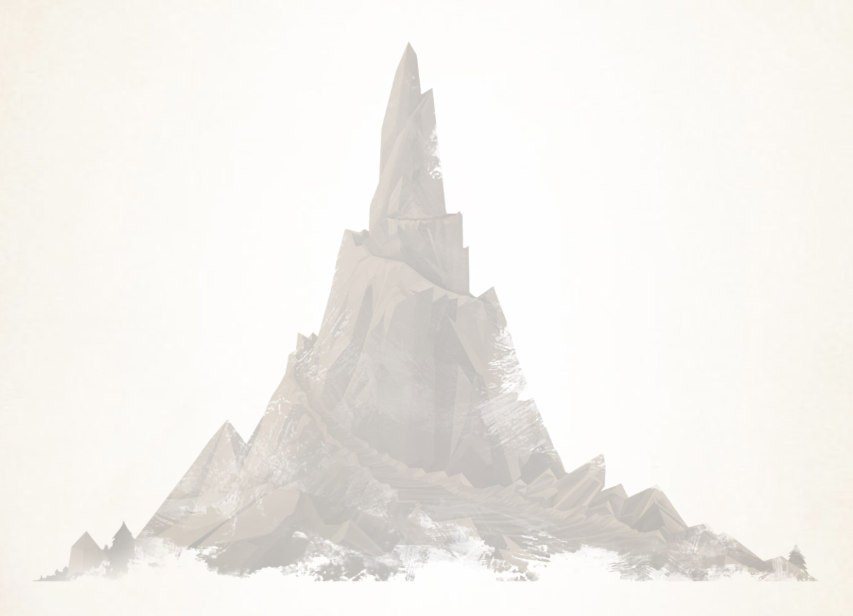
Pro tip: All of the pictures you will see were originally published on Diggy's Instagram page (@diggysadventure). To enjoy them in a proper order, make sure to always start from the bottom right corner. However, you might find some lifts and ladders which will change the flow of the story, but no worries - just follow Diggy's steps, and you will be alright;)

Dear Diggy players! Our beloved adventurer is now 8 years old - happy birthday, Diggy! Such a milestone Deserves a proper celebration, so we hope you will enjoy The brand new e-book we have prepared for you. Buckle up, and immerse into the Scandinavian Quest!